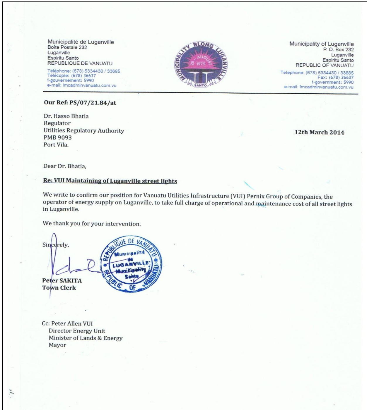
Figure 1: Letter from Municipal Council to URA CEO for transfer of Street Lighting services responsibility to VUI